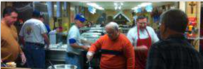
Council #1487 Held a Breakfast With Santa event for the kids.