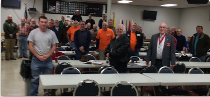
Council #6743 Clarkson