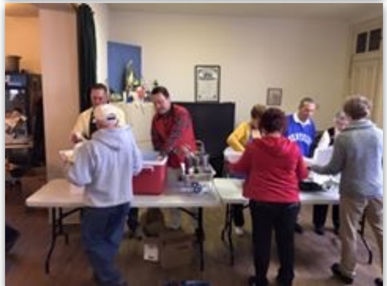
Council #1377 in Maysville with help from members and non members prepared and delivered Christmas Day dinners for approximately 750 people with all the leftovers being donated to the Women's Crisis Center. It was a great day! (photos on right)