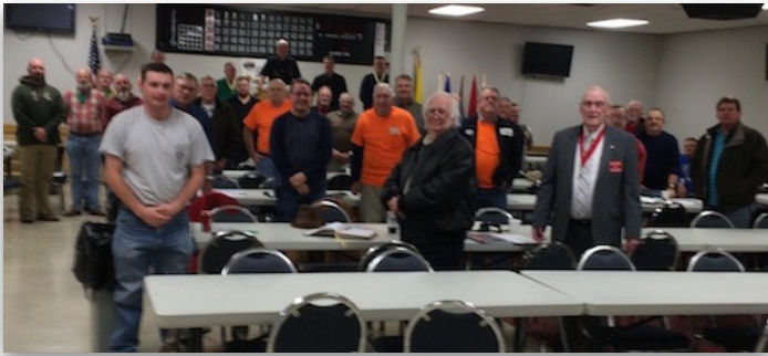
Council 6743 raised and donated $22,500 to charity in the fourth quarter of 2014. Brother Knights living the lesson of Charity.